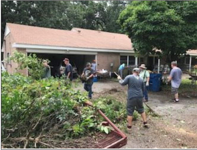
WORK DAY @ PARSONAGE GETTING READY FOR NEW PASTOR